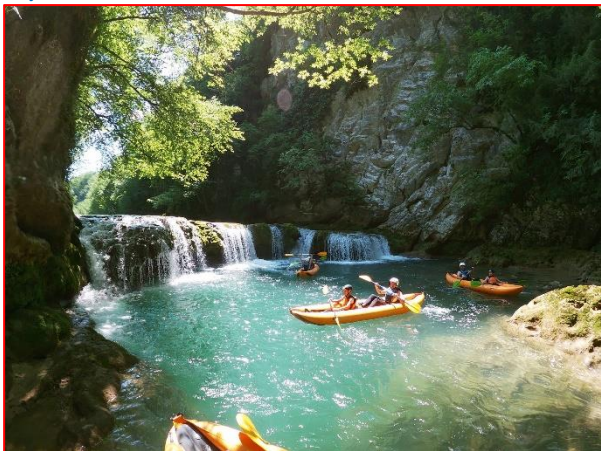
Kayak safari, Rastoke