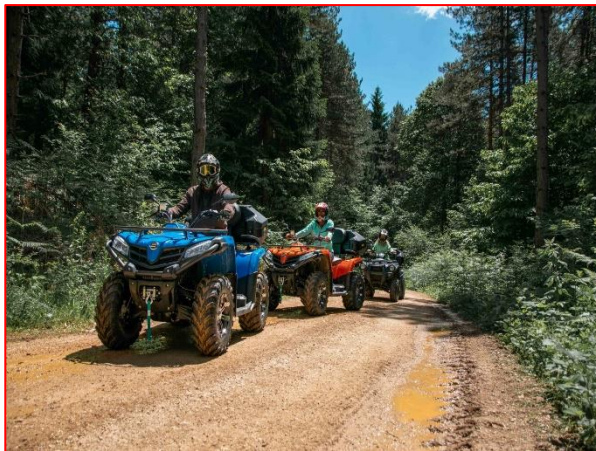
Quad safari, Rastoke