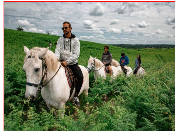
Horseback riding, Rastoke