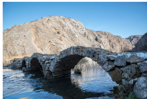
Krupa river, hiking