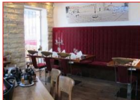
Pet Bunara, Zadar