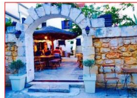
Kaciol, Biograd na Moru