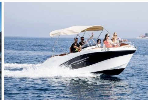
Various private boat tours