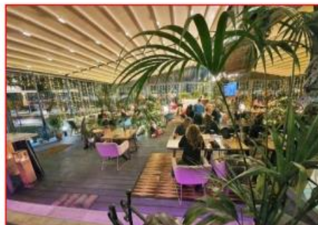
Butler Gourmet & Cocktail, Zadar