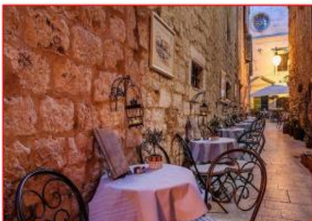
No. 4, Šibenik