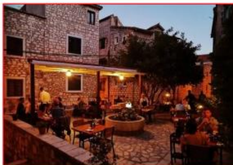
Konoba Gorica, Šibenik