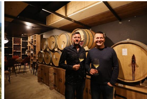
Various winetours & tastings