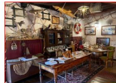
Konoba More, Vodice