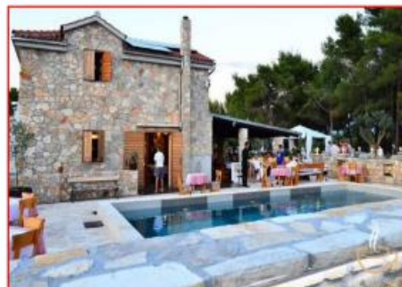
Karmelski Dvori, Vodice